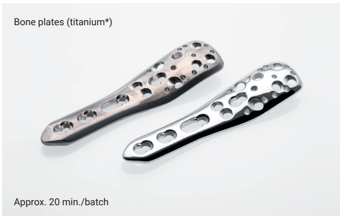
Approx. 20 min./batch