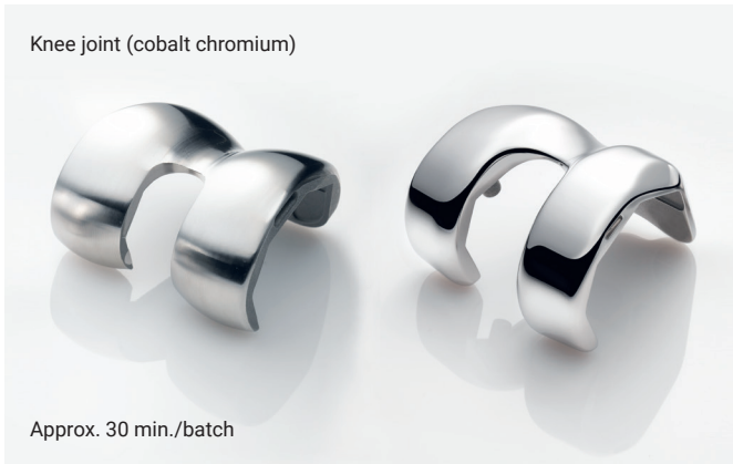
Approx. 30 min./batch