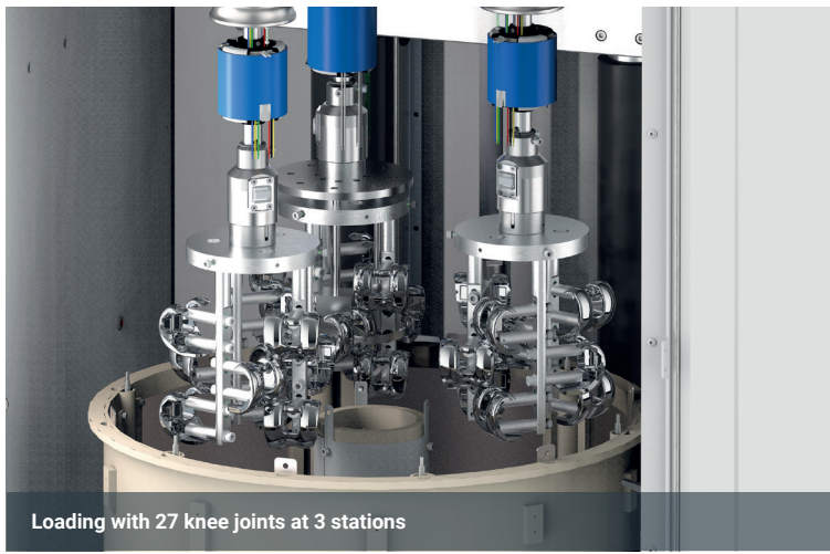
Loading with 27 knee joints at 3 stations