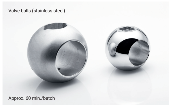
Approx. 60 min./batch

* Processing in specially equipped EF-Performance